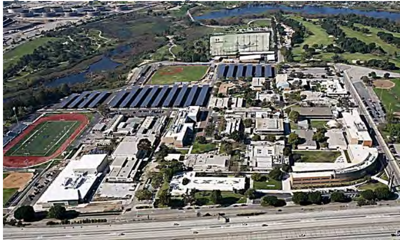
Figure 1.3 Los Angeles Harbor College, 2023

approximately 20 miles south of downtown Los Angeles and a few miles from the Port of Los Angeles. With 60 percent of students identifying as Hispanic, the College is designated as a Hispanic Serving Institution. Nearly 65 percent of the students are 24 years or younger, and approximately 55 percent of incoming students indicate their educational goal is to transfer to a four-year university.